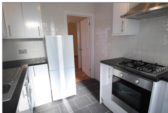
Kitchen with appliances

Perry Hall Close is located close to Orpington High Street with its many amenities, Walnuts sports centre, cinema, hotel and Orpington Mainline station. The property is also within easy walking distance to Perry Hall Primary School with many bus routes. Nugent Retail Park is approximately a 5 minute drive away with many major shops such as TK Max, Next, Debenhams, Mothercare, Pets at home, Clarks, Marks & Spencers, Nandos and more!