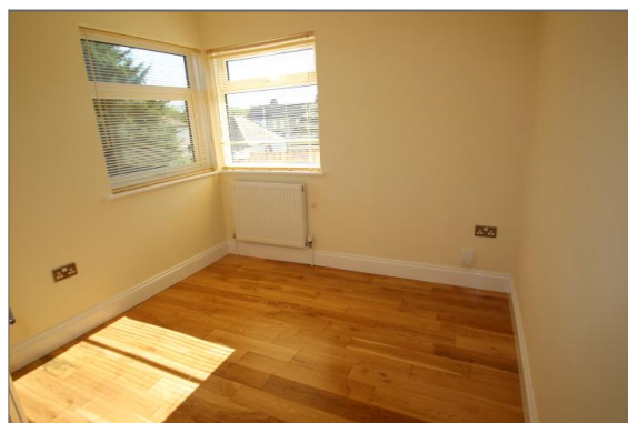
Bedroom 2 (single)