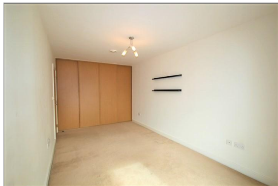
Double bedroom with fitted wardrobes