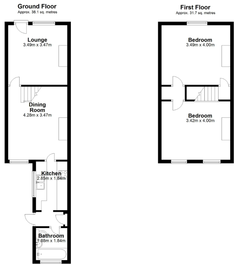
Total area: approx. 69.8 sq. metres 11 New Road, Orpington